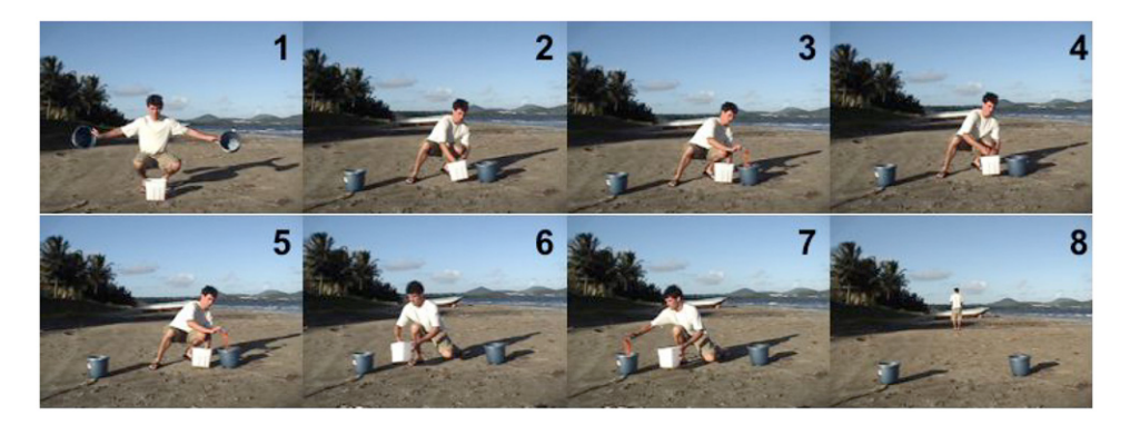
Fig. 1. Sample frames from the subject's point of view for the comparison of 1 vs. 2. The experimenter presents the opaque containers to the subject (Frame 1), and then sequentially pours two scoops of carrot pieces into one container (Frames 2–5). He then pours one scoop of carrot pieces into the other container (Frames 6–7) and walks away (Frame 8), allowing the subject to choose one of the two containers.

A single experimenter approached lone monkeys who were not engaged in any activities such as eating, grooming, or fighting, and stopped approximately 2–3 meters away. The experimenter then presented two large, opaque containers (12 in. in diameter, 10 in. in height), showing that they were empty, and simultaneously placed them on the ground, 2 m apart. The experimenter then removed a small transparent cup (5 in. in diameter, 3 in. in height) from a plastic bucket (11 in. in length, 8 in. in width, 10 in. in height), lowered the cup into the bucket, filled up the cup entirely with carrot pieces (.3 in. in length, width, and height), and then poured the food into one of the containers. All of the pours were sequential, each one taking approximately 2 s to complete. The presentation can be seen at http://www.people.fas.harvard.edu/~jnwood/. After the presentation, the experimenter stood up, turned 180°, and walked away (see Fig. 1). If the subject did not approach within 10 s, we aborted the trial. The experimenter ensured that the subject watched the entire presentation. Subjects were excluded from the final analysis if